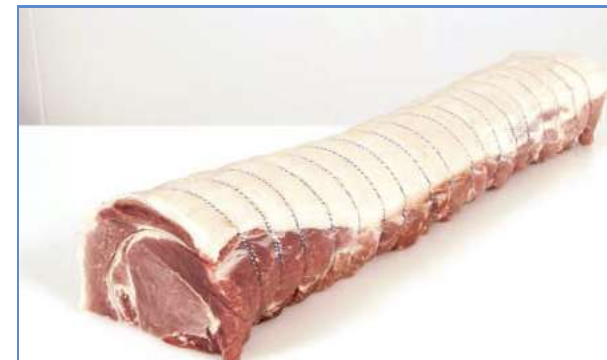
3 Roll the joint and secure at regular intervals with roasting bands or string.