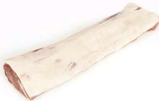
2 Loin – boneless, rindless. Maximum fat level 10 mm.