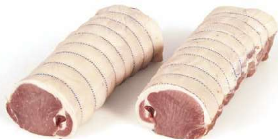
4 Loin Joint – boneless and rindless.