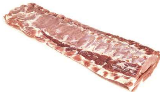
1 Loin – boneless, rindless.